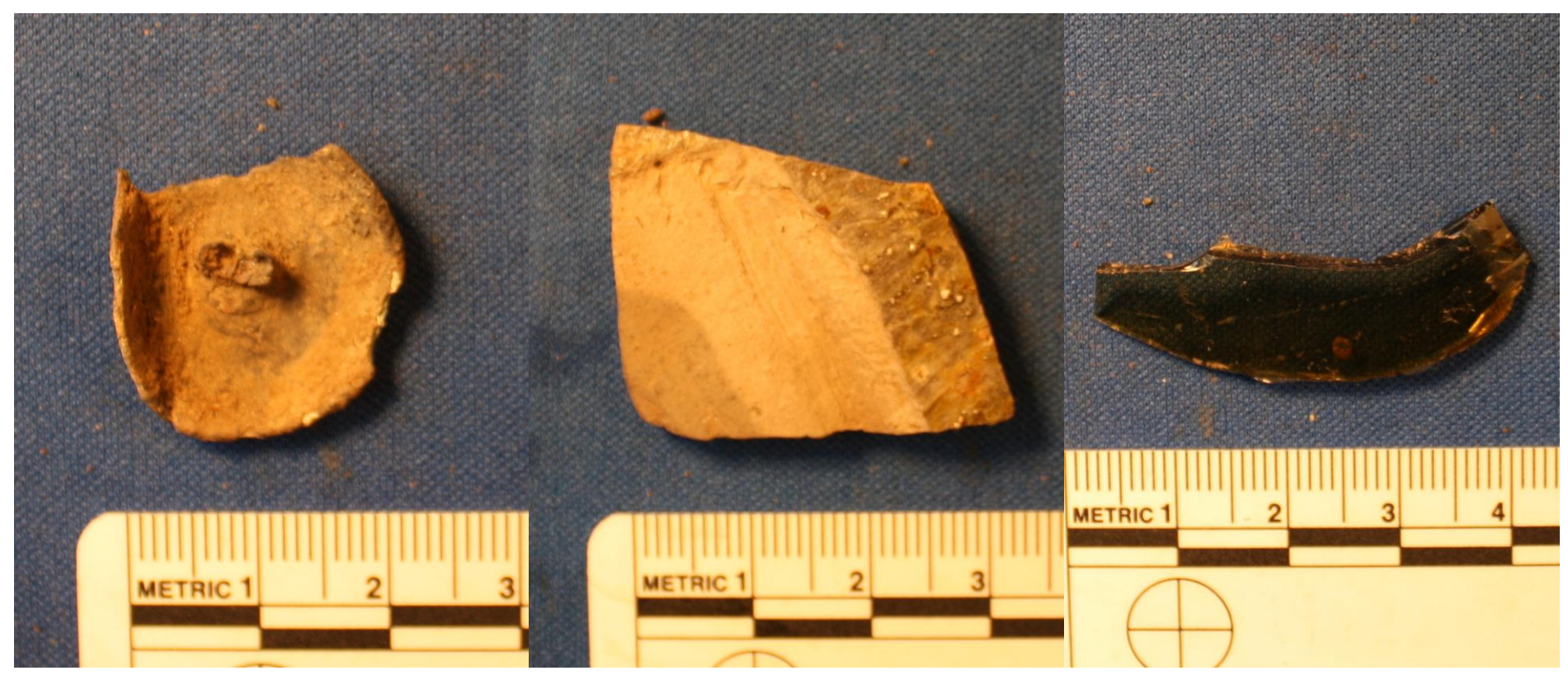
Figure 2. A selection of finds from trench 1 discussed in the text. Left: abraded pewter button with fastener (FN134). Centre: sherd of possible late medieval reduced ware (FN 140). Right: sherd of fine, hand blown green bottleglass (FN 133)