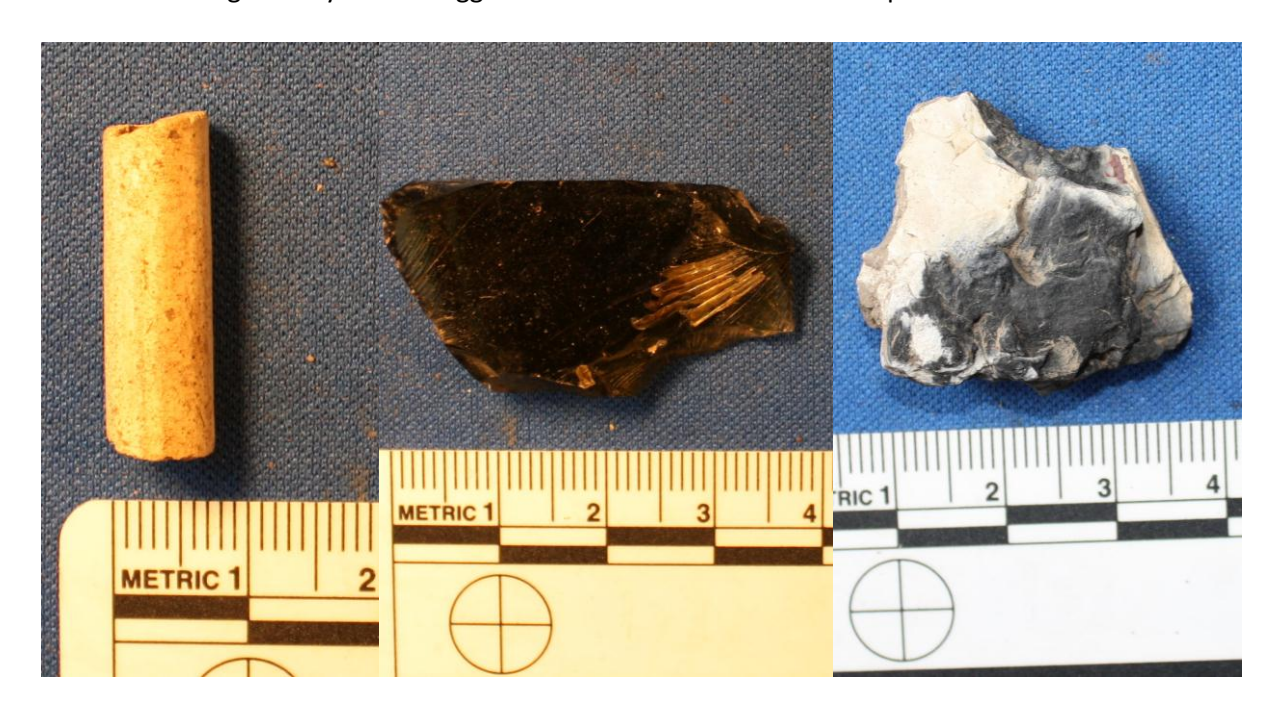
Figure 5. A selection of finds from trench 5 discussed in the text. Left: Clay pipe stem of possible early 18<sup>th</sup> of 17<sup>th</sup> century date (FN519). Centre: sherd of coarse hand blown green bottleglass (FN 521). Right: Example of burnt clay found in context 502 (FN 518).

indicative of Early Modern metalworking. Context 502 is interpreted as a relatively undisturbed occupation layer that is likely to predate the 19^{th} century and may contain material which is 17^{th} century or older. It was not possible to ascertain the full extent of this deposit but probing and informal investigation by trowel suggests the context continues to a depth of at least 100cm.