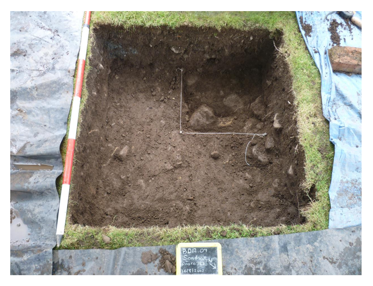
Figure 4. Trench 4 post-excavation record show showing sondage.

Trench 5 – Ashgrove, Quarry Road – Excavated by Albie and Sheona Sinclair, Daniel Dompierre-Outridge, Natalia Rebollo, Kevin Grant, Louisa Campbell.