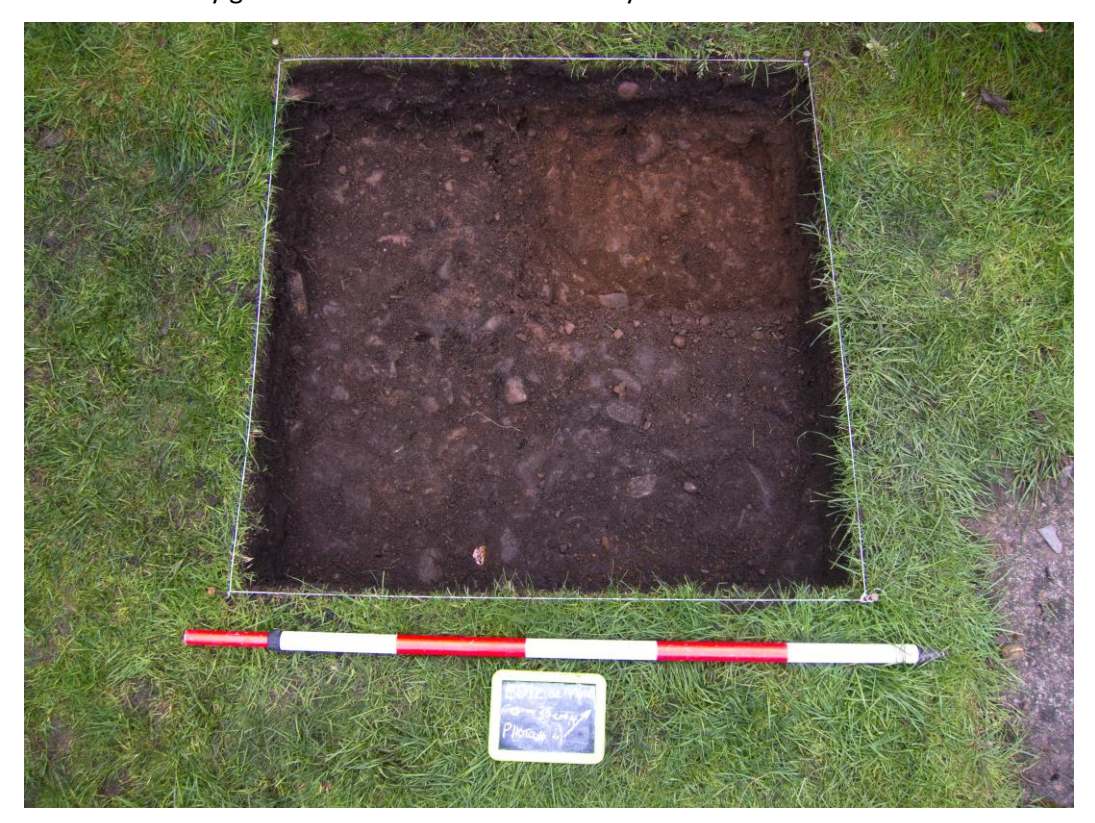
Figure 3 . Trench 2 Post excavation showing sondage, contrast between contexts 201 and 202 is clearly visible.

Information from the owners of the Bakehouse suggested that the area of excavation abutted the former coal shed. It may be that the area was kept clear as an area of hard standing outside this feature and covered by garden soil in the late 19<sup>th</sup> century.