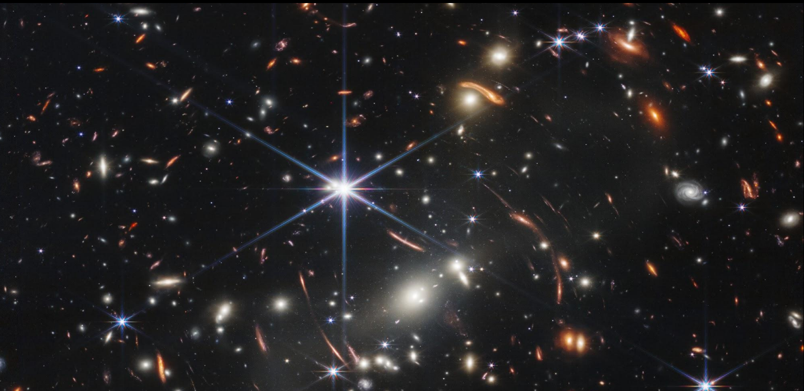
Image credit: NASA / JWST Webb First Deep Field, https://www.nasa.gov/sites/default/files/thumbnails/image/main_image_deep_field_smacs0723-5mb.jpg

Version 2.01, valid for academic session 2023-24