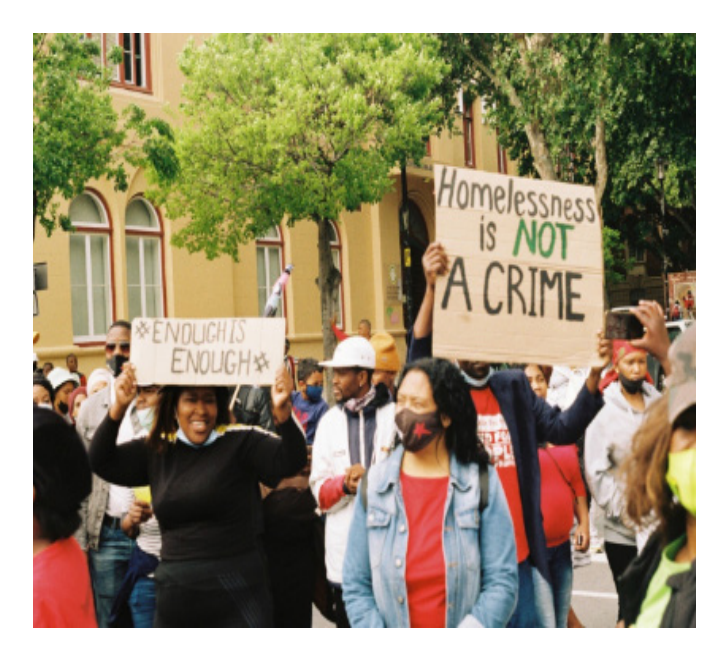
Image 1: Protest march against City of Cape Town's new bylaws.