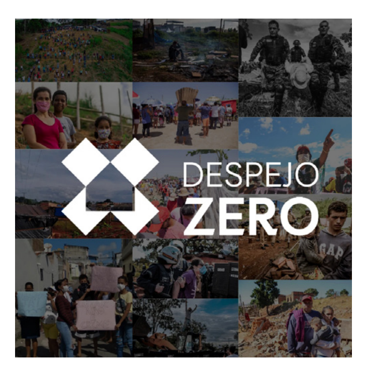
Image 2: Campanha Despejo Zero (Zero Evictions Campaign).

Today thousands more people are living on the streets of São Paulo than at the start of the pandemic. While numbers are hard to determine with certainty due to the lack of a recent census, the rise in homelessness is noticeable throughout the city. New occupations have emerged, both in the urban periphery as well as in the urban centre, on public and private land or buildings. These include Occupation Jardim Julieta in the North Region of the city, and Ocupação dos Imigrantes (Occupation of Immigrants) Jean-Jacques Dessalines, a smaller-scale occupation of a building in the centre of the city. The occupation is located in the central neighbourhood of Liberdade, and is occupied by 80 migrant and refugee families, mostly from Haiti. Occupations have played a key role during the pandemic, serving as centres of mutual support and providing resources to people in situations of vulnerability during the pandemic.