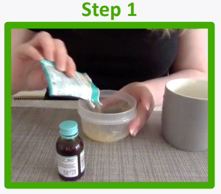
Dissolve gelatine powder in hot water