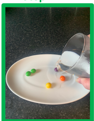
Add water to plate and watch what happens...