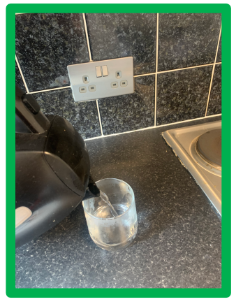
Pour hot water into a glass