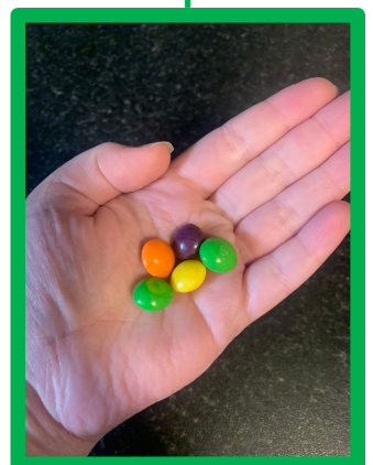
Select 5 sweets of different colours