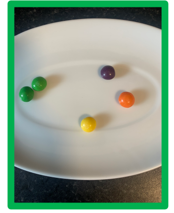
Arrange your sweets on a plate in a design