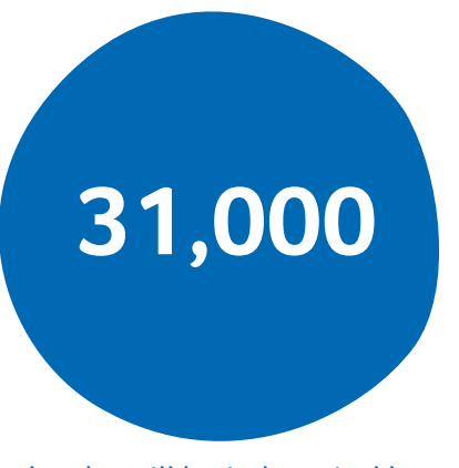
deaths will be in hospital by 2040 if community-based services don't get the support they need.