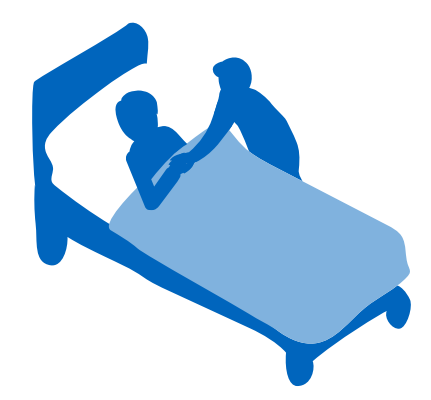
By 2040 45% of all deaths (29,590) are projected to be in people aged over 85.