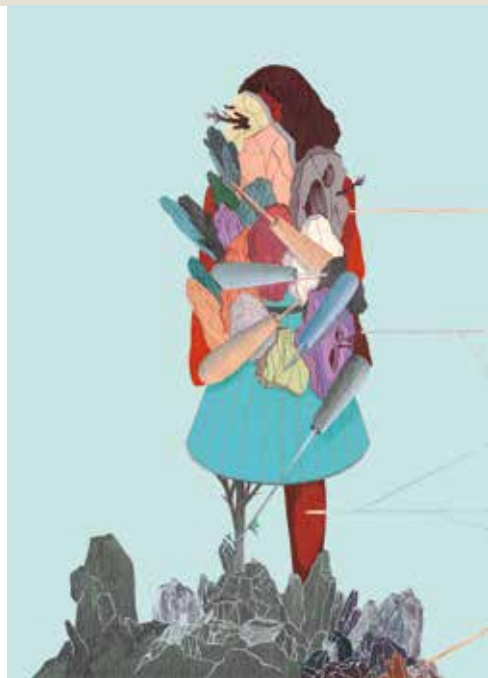
Top Left: Marcel Dzama, A Time Will Come or Delilah and Goliath , 2017.