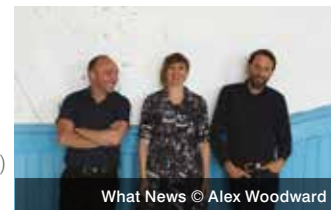
What News © Alex Woodward

Featuring interpretations of old Scots ballads – muckle songs – arranged for voice, piano and electronics. Named after their recent album, the programme is a foray into traditional song, with idiosyncratic, forward-thinking arrangements, sure to appeal to aficionados of both traditional song and experimental music alike.