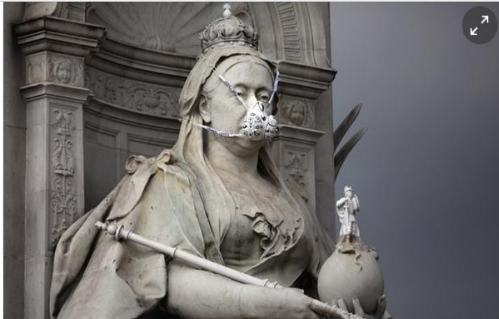
A face mask placed on the statue of Queen Victoria opposite Buckingham Palace to highlight air pollution.

People in the UK are 64 times as likely to die of air pollution as those in Sweden and twice as likely as those in the US, figures from the World Health Organisation reveal.