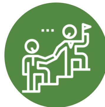
Data Science Mentoring