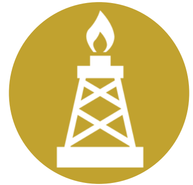
Energy, Oil & Gas