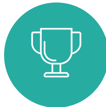
Data Innovation Award