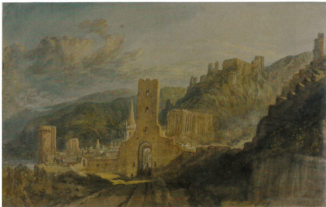
Fig. 1 Bacharach and Burg Stahleck , 1817, watercolour, gouache and gum arabic with scratching out, 20.4 x 32.2 cm; mounted on board (W 642; The Hunterian, University of Glasgow, GLAHA 42480)

The large and celebrated group of coloured drawings inspired by Turner's 1817 tour of the Rhine between Mainz and Cologne and purchased by Walter Fawkes is now widely dispersed. The existence of a watercolour in this group depicting Bacharach and Burg Stahleck (fig. 1) has long been recorded. It was listed among the works in the Fawkes collection by Turner's first biographer, Walter Thornbury, in 1862. It was lent by Walter Fawkes' descendant, Ayscough Fawkes, to the Royal Academy winter exhibition of 1889, and exhibited under the title Bacharach and Stahleck . It was described with some detail in the catalogue: 'In the centre of the picture is the wall of a town, with a road leading through an arch at the base of a tower, which forms part of it; farther off is seen a ruined castle on a hill; a glimpse of the river appears on the l. in the middle distance; on the r. a terrace with a vineyard above it, and the wall running up a steep hill; light clouds, with afternoon sunlight on the town; foreground in shadow. Size 7 3 / 4 by 12 1 / 2 in.' 1 Sir Walter Armstrong's Turner (1902) also lists the work, describing it along the same lines as the 1889 catalogue. He also notes its inclusion in the Fawkes sale at Christie's in 1890. Wilton's catalogue raisonné of the watercolours (1979) includes the work under the same title, Bacharach and Stahleck , giving its medium, dimensions and provenance. There is no illustration and it is noted as untraced. Cecilia Powell's Turner's