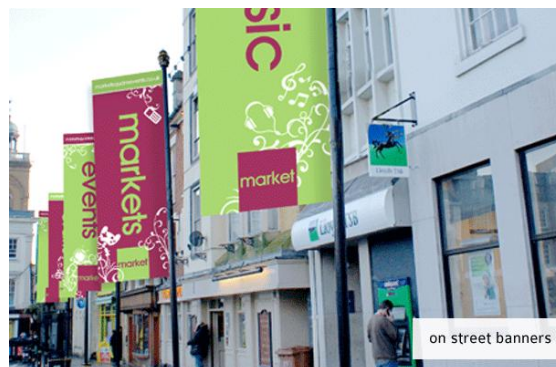
Figure 1. Vertical Banners [2]

These are such fancies we have in our real world. Could you imagine an interesting life without all this stuff? So, infact we are not intelligent enough but our surrounding is. Do you think that space satellite have such fancies?And the answer is no. again question is why not?