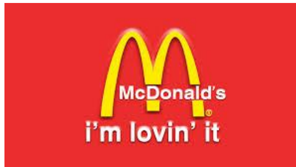
Figure 4. Vertical logo sign [5]