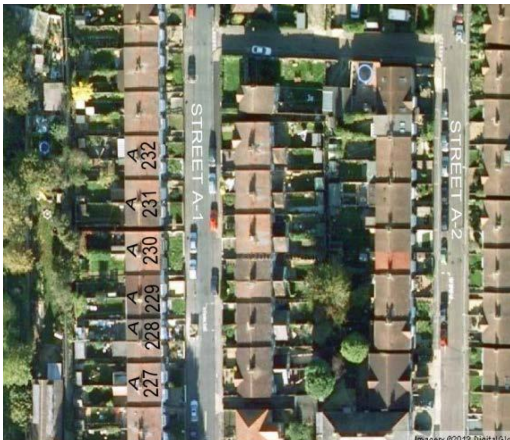
Figure 8. A well planned and organized area in London: Alphabetical and numerical labeling scheme for residential buildings and streets. Streets and roads can also be labeled in same way [9]

Residential buildings mostly do not have logos or icons instead they have addresses which contain alphabets and numbers. Individual houses and residential apartments mostly fall under this category. We can paint the house number or numbers on the roof. Most of the addresses are a combination of alphabets and numbers ( Figure 8 ). This is true that such labeling scheme is a difficult job for residential buildings because every building does not meet the desired labeling orientation but it is not impossible at all. A bucket of black and white paint can do accomplish this job easily. Figure 8 is an example of well planned and organized area in London UK. Such countries have well planned and modernized buildings with complex structures, which makes somehow this labeling scheme difficult. But such countries already have up to date GIS datasets with complete and accurate addresses. Developing countries have simple and flat roof buildings almost 80 buildings in developing countries have flat roof buildings. Flat roofs are ideal places for putting the alphabetical and numerical labels.