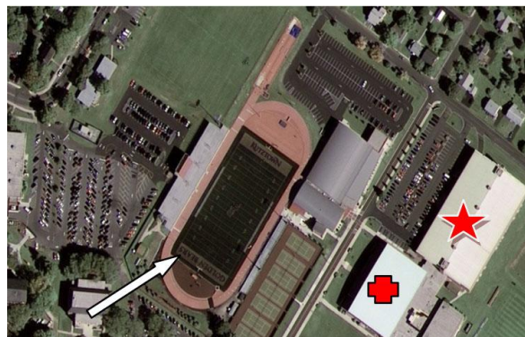
Figure 6. Geoeye-1 1st high resolution image which contain a Labeled building. GOLDEN BEARS, Red symbols are supposed Cartographic symbols that can be placed over such buildings [7]