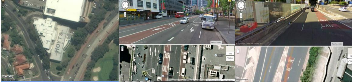
Figure 9. Real world examples: (a) HOYTS Sydney Australia [10]; (b) Google Earth Sydney Australia [11]; (c) Google Earth Sydney Australia [11].

The question may rise in the mind, is this happening anywhere in the world? The answer is yes, but this is happening occasionally but not intentionally. Here are some real world examples given below in Figure 9 .