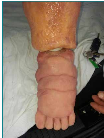
fig 1. Prosthetic leg/foot showing the skin and shape distortions typical of advanced lymphoedema