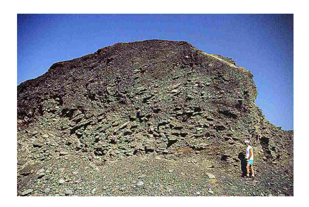
Figure 4. Slag heap section AU5 at Skouriotissa Vouppos (TP007).