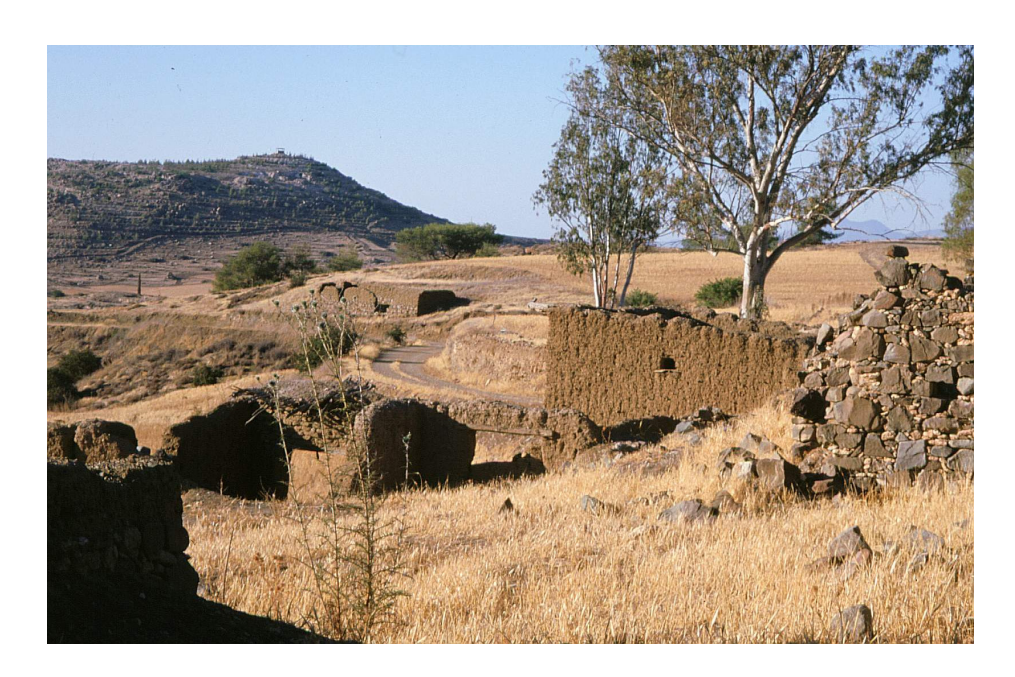
Figure 3. Settlement at Kato Koutraphas Mandres (TS07), from the southwest.