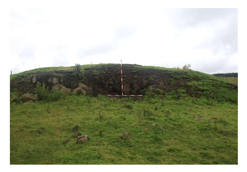
Fig. 6. Quarry with earlier (left) and later (right) phases (SF144)

We also recorded a small quarry adjacent to the road to Montalt Farm (SF144; Fig. 6). Its main face was divided into two sections, of which the western was less lichenated and eroded and cut more deeply into the outcrop, so presumably was exploited in a later phase. A 19th-century stone dyke runs just over 100 m to the south-west. Like the many other very similar quarries recorded in previous seasons (Dalglish and Given 2009; Given 2008), this was clearly exploited for the construction of the dyke. The later phase was presumably to repair the dyke, or perhaps for building activity at Montalt Farm.