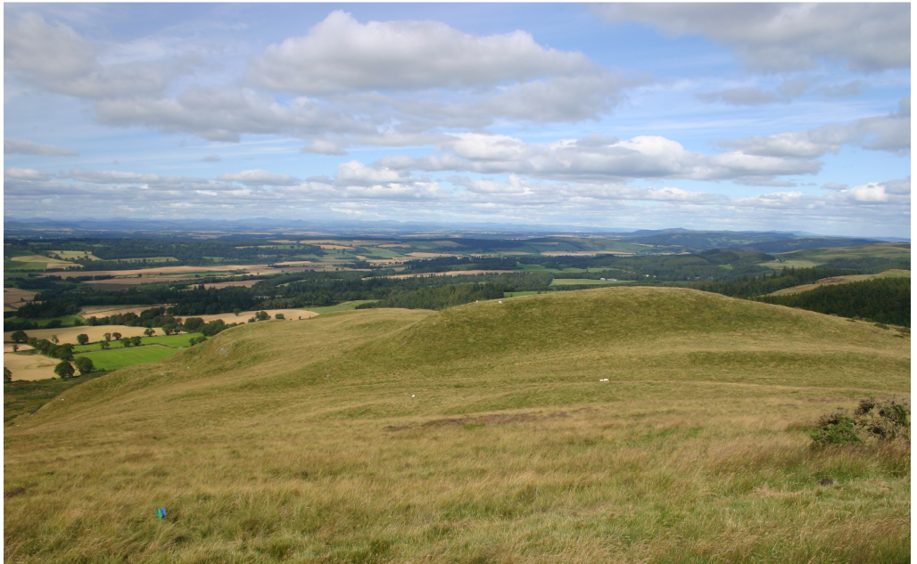
Fig. 1. View from cairn on Clevage hills looking north to Craigenroe Hill, Strathearn and Forteviot