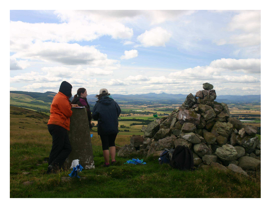
Fig. 5. Conical cairn on Casken Hill (SF142)

Round the cairn, mainly extending across the flat hilltop on its southern side, was a possible oval platform apparently marked by small boulders (SF143). Its widest diameter was 23 m. Possible interpretations that were discussed include a prehistoric henge, Pictish hillfort, and camp for the Ordnance Surveyors using the trig point.