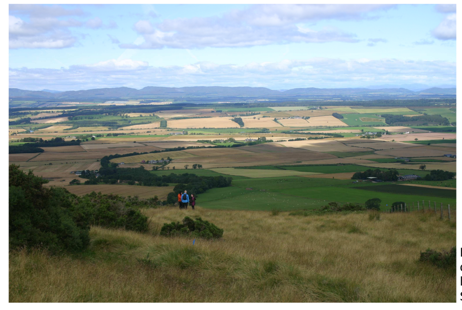
Fig. 3. Section of head dyke or enclosure wall, looking north across Strathearn

The enclosure was presumably for tathing, the penning of animals on poor land to enrich the soil for future cultivation, particularly during periods of agricultural expansion into the uplands. In previous seasons we have recorded similar enclosures to the west, on Casken Hill (Given 2008) and round Thorter Burn (Dalglish and Given 2010).