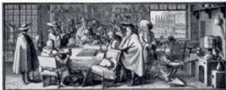
FIG. 2.—La leçon de chimie au Jardin royal From a vignette by Sébastien Leclerc, 1676

During the 17 th and 18 th centuries, lectures and demonstrations in chemistry, which were given at Le Jardin du Roi, in Paris, had a far reaching influence on the development of the science not only in France but throughout Europe 1 .