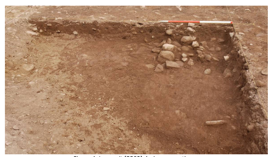
Figure 4: Large pit [5502] during excavation

A micro-morphology sample was taken from the primary fill and the natural clay in order to ascertain how long this sediment took to form, and to identify any pollen that may remain in the soil in order to help date this feature and reconstruct the environment at the time.