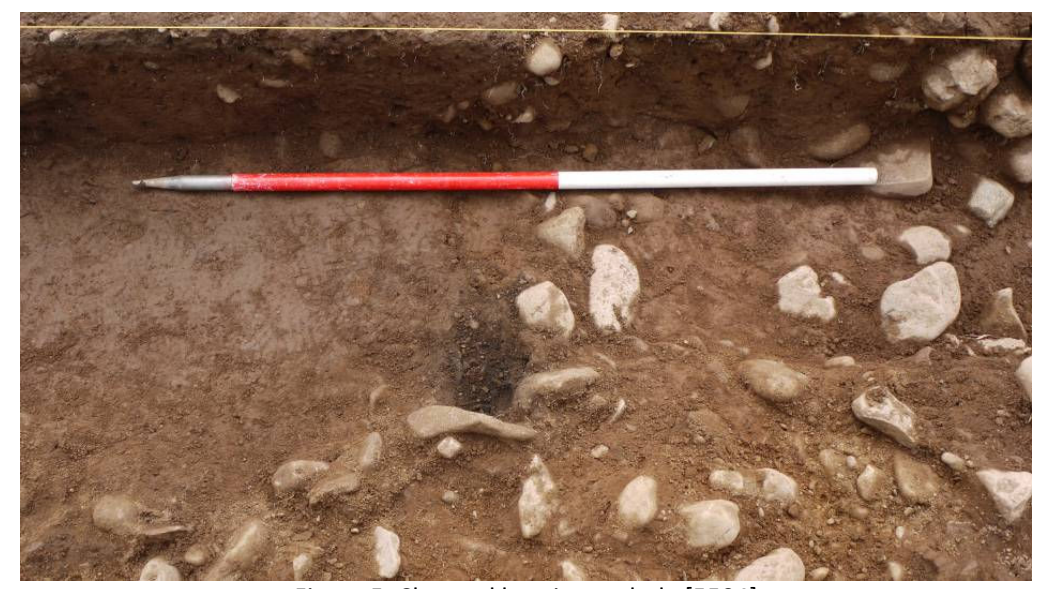
Figure 5: Charcoal lens in posthole [5504]

There was a lens of charcoal and dark silty material (5573) in the southwest area of the posthole (see Figure 5). This lay just outside postpipe (5575), and c.15cm below the surface. (5626) was to the north of postpipe (5575), and consisted of dark brown silt with small stone inclusions. This fill may well be the same as (5627), which was also a dark brown silt fill with small stone inclusions, that lay between (5575) and (5574). Fill (5627) also came down onto rounded stones (5623), probably packing. The penultimate fill found was (5624), a pink-grey clay which underlay (5575). This fill may also be part of the postpipe, but as it was under the level of the water table, this may explain the different soil-type. The lowest fill of posthole [5504] was (5625), medium brown-grey sandy clay. This appears to be similar to the natural clay, but is slightly darker in colour, and contained charcoal inclusions. As this post does not appear to have been burned, this charcoal may represent deliberate deposition in the bottom of the posthole prior to the post being erected, or the charring of the base of the post to increase the life of the post.