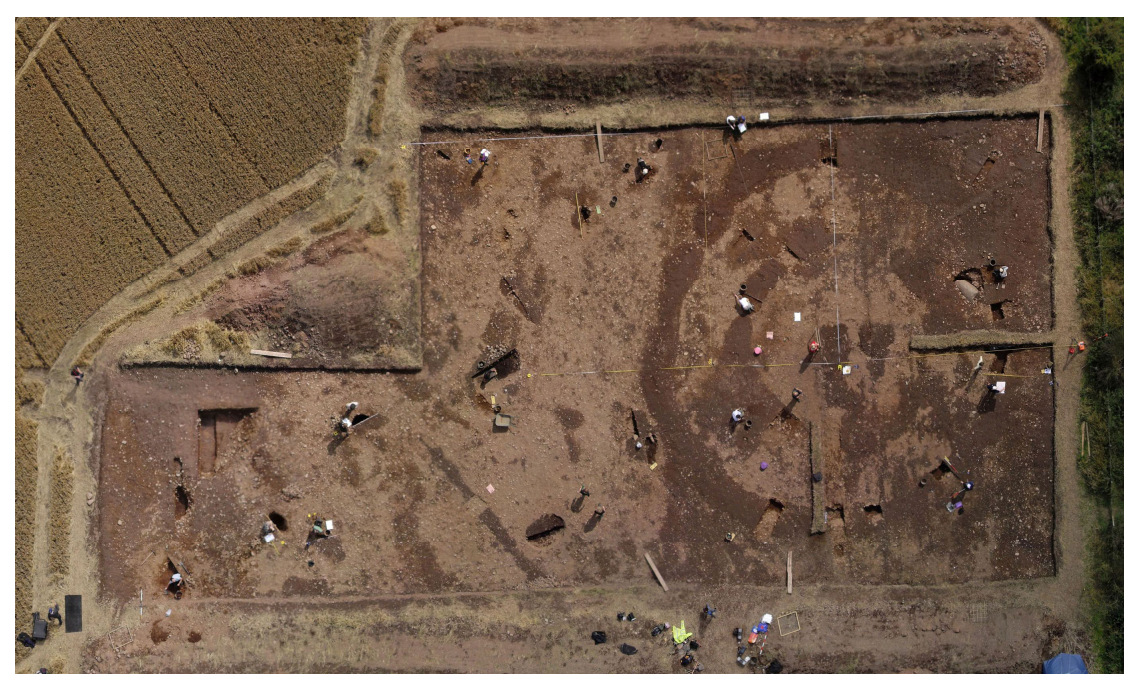
Figure 2: Vertical image of Trench 5. The Trench 5B area is left (east) of the red line. Grid north is towards the bottom.

Trenches 5A and 5B essentially denote areas within a larger trench, 5, situated over a range of cropmarks across the northern side of the palisaded enclosure. Trench 5A focused on the double palisaded enclosure and is discussed in a separate report (James & Gondek 2010). The area covered by trench B was L-shaped, with the eastern half measuring 30m north-south by 10m, and an extension measuring 20m east-west by 15m running from its southwest edge. The distinction between the two areas was based on a roughly arbitrary notional line running north-south, with area 5A to the east.