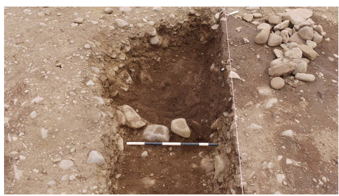
Figure 8: (5519) packing stones

Posthole [5592] was a very difficult feature to define and excavate, in part due to the posthole apparently cutting an earlier feature that had not been identified in plan. Posthole [5592] measured 1.2m across in plan, with a maximum depth of 1.12m. There was no evidence for a ramp in [5592]. The possible postpipe of [5592] was (5593), dark orange-brown sandy silt with flecks of charcoal. This was distinct from the upper packing fill (5683), which was a medium yellow-brown sandy silt containing frequent rounded pebbles. This fill may have been the natural used as packing. Below (5593), were packing stones (5604). The packing appeared to have tumbled down the sides and towards the bottom, possibly after the post was removed, or as it rotted. Below this stone fill was (5684), medium yellow-brown silt containing charcoal and very infrequent stones. The lowest fill (5685) contained notable amounts of charcoal, as with the other postholes. Little can be said about the feature which [5592] cut due to the difficulty we had in identifying the complex nature of this feature in plan. However, it is possible that [5562] represents an earlier post replaced more or less in the same location.