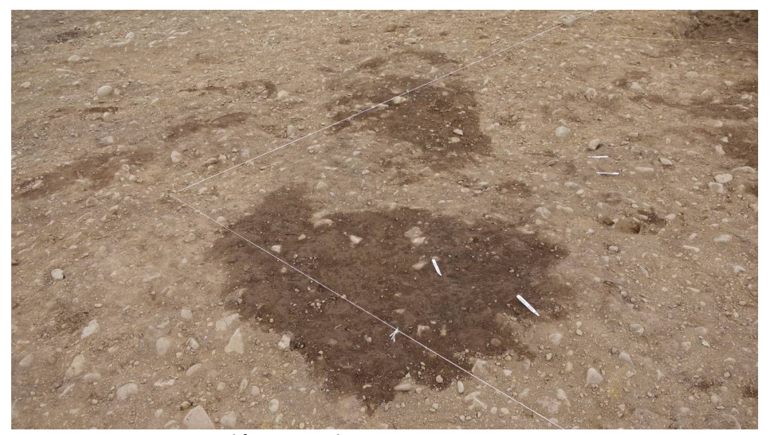
Figure 15 Typical features in the avenue junction area pre-excavation

Feature [5654] was oval in plan and flat-bottomed with sloping sides. This feature was 1m by 0.8m in plan, but was only 0.21m deep. The single fill (5655) was a dark brown silt with c.20% stone inclusions.