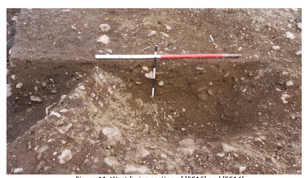
Figure 11: West facing section of [5516] and [5514]

Pit [5514] cut a tree-throw [5516] towards the northeast end of the pit (see Figure 10). This large feature had a single fill, (5517), which yet again had within it a cup-marked stone (SF 5521) indicating that potentially this tree was felled a short time before the pyre pit was situated here.