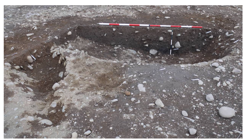
Figure 10: North facing section of [5514]

Pit [5514] cut a tree-throw [5516] towards the northeast end of the pit (see Figure 10). This large feature had a single fill, (5517), which yet again had within it a cup-marked stone (SF 5521) indicating that potentially this tree was felled a short time before the pyre pit was situated here.