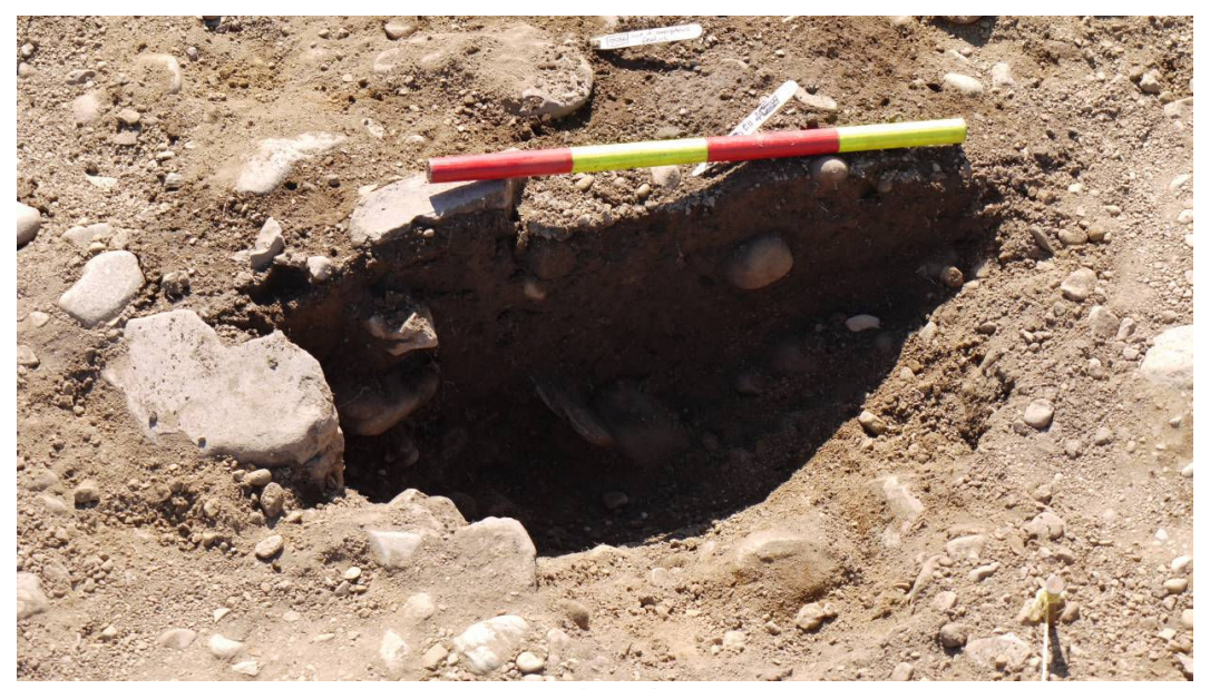
Figure 13: Small post or pit [5566] on semi-circular setting

presence of the stones could indicate they were remnants of packing for a post (see Figure 13). The third feature [5568] was quite difficult to differentiate from the natural, and was similar in nature to [5566]. The fourth feature of the setting was palisaded enclosure boundary posthole [5613].