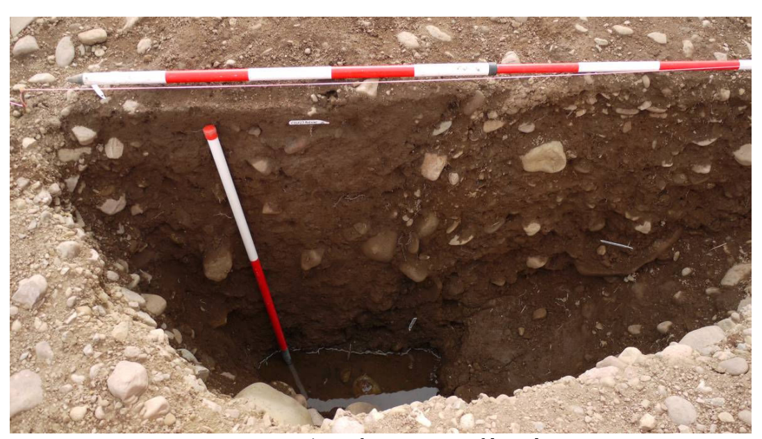
Figure 7: Northeast facing section of [5518]

Posthole [5518] was bisected by fairly shallow modern drainage feature [5520] (see below). This ramped posthole measured some 1.6m by 1.05m, with maximum depth of 1.2m. The upper fill of the ramp on the NW side of the feature (5662) was medium orange-brown sandy silt, with gravel and infrequent stone inclusions, as well as several pink clay lenses, as in the ramp fill of [5538]. The lower ramp fill (5672) was darker orange-brown sandy silt, also with gravel and infrequent stone inclusions, though also had charcoal inclusions towards the bottom of the context. Within this charcoal was a single example of a charred nutshell. The postpipe (5572) was a very homogenous dark brown silt fill, with charcoal inclusions towards the bottom of the context.