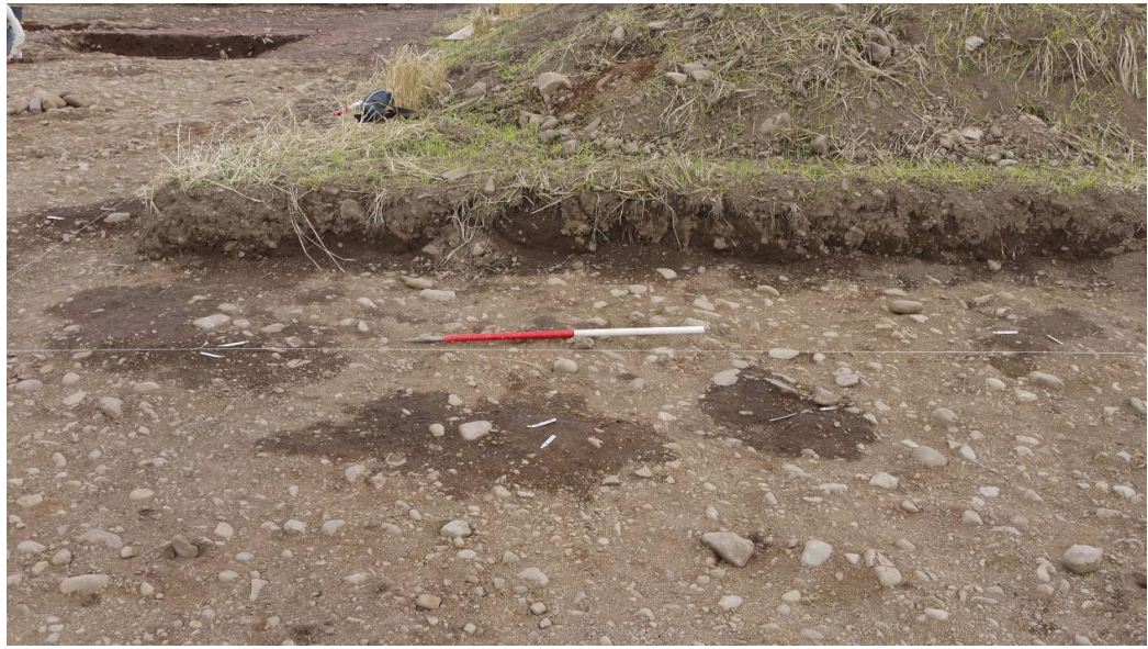
Figure 12: Arc of posts, or semi-circular post setting

Feature [5564] was the southernmost of the possible postholes. This feature was fairly amorphous in plan, with a slight NW-SE alignment. It measured 1m by 0.58m and 0.38m deep. The upper fill was (5565); at only 0.05m thickness, this deep dark brown silty sand was most likely remnants of the topsoil. The other upper fill (5617) was restricted to the northwest end of the feature; this was medium yellow brown silt, only 0.06m deep. The rest of the cut was filled by (5619), a medium orange-brown coarse sand and gravel fill, very similar to the natural, but very compacted. There was no evidence for a postpipe in this cut, so any post may have been removed, allowing the natural soil to wash in, with only a little of possible original fill remaining, with a few stones that may be the remnants of packing. This may also have been a pit.