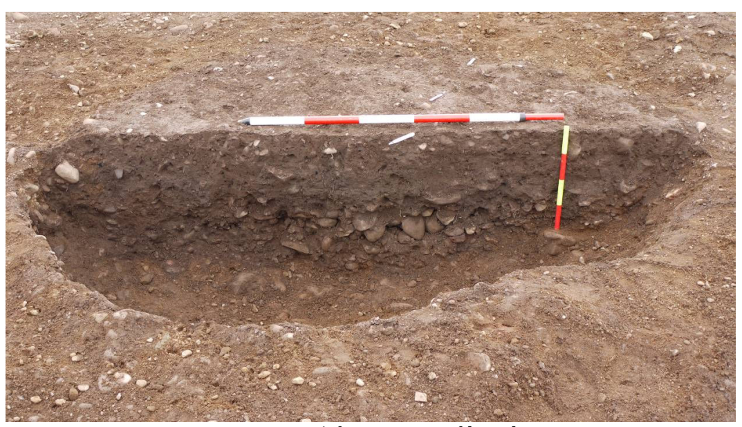
Figure 9: North facing section of [5512]

The most northerly of the three features was a large pit [5512] that was 2.5m by 1.9m in plan, and up to 0.56m deep. The pit had shallow sides, slightly steeper on the eastern side, with the base relatively level but sloping down to the east (see Figure 9). The upper fill of this pit (5513) was extremely charcoal rich, with individual pieces of charcoal at up to 10x7x5cm in size. There was also a significant amount of burnt bone. Though these were spread throughout the fill, there were some concentrations within the fill. The lower fill (5598) of this pit was a 30cm deep dump of small rounded stones, maximum size 17x15x7cm.