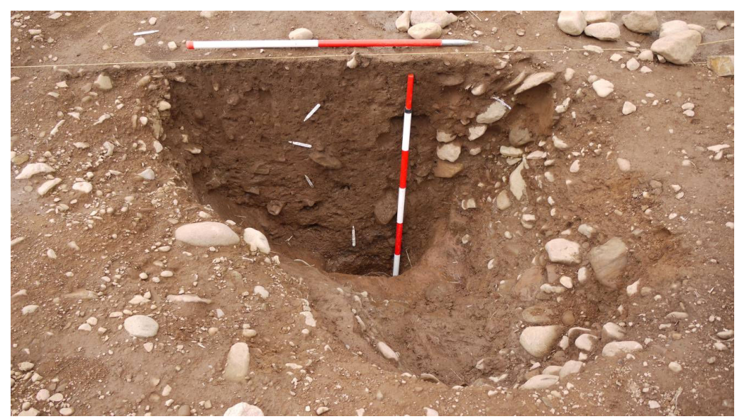
Figure 6: East facing section of posthole [5506]

The avenue posthole immediately the north of [5504] was [5506]. Due to the remnants of a palaeochannel running through the trench here, this posthole was not as clear as those on the western side of the avenue were. (This scenario was also encountered in 2007.) The eastern half of this feature was excavated. In plan this feature was 2.06m x 1.9m, and up to 1.3m deep. The sides of this feature were vertical on the SE and NW, but were stepped to the NE (see Figure 6). This has been interpreted as the ramp of this feature; the steps used by those digging the feature were then used to aid the erection of the post. The section string was moved during excavation of this feature in order to get a safe working space to reach the bottom of the feature.