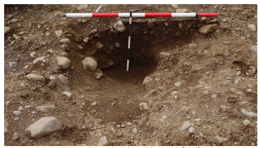
Figure 14 Section through possible posthole [5646]