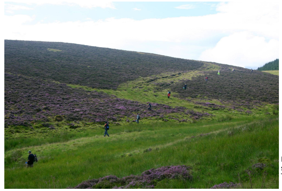
Fig. 1. Walkover survey crossing the Thorter Burn