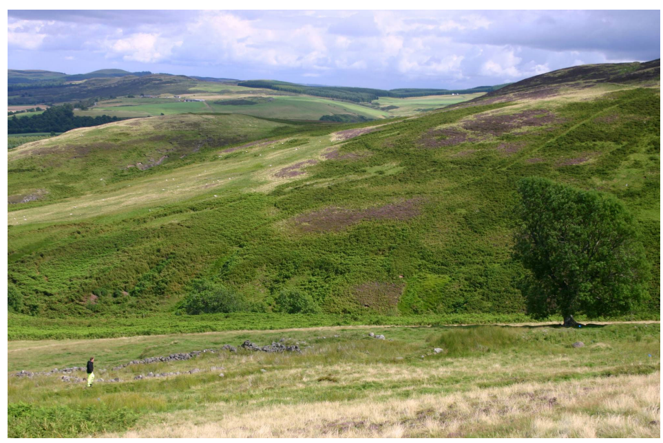
Fig. 4. 19th century sheepfold with earlier farmstead (SF133)

On Waughenwae Knowe is a series of quarries clearly associated with the construction of the straight stone dykes marking 19th-century improvement. These are very similar in size and function to quarries found in previous seasons. On the summit of the knowe is a substantial enclosure with an area of rig and furrow within it (Fig. 5).