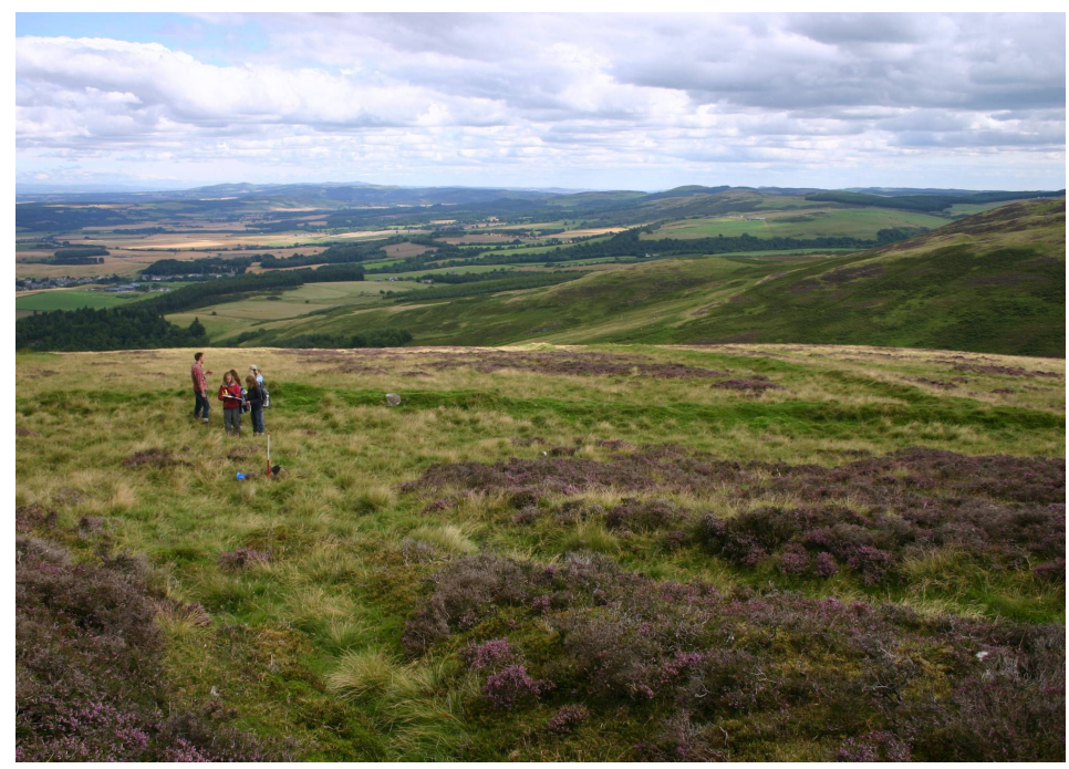
Fig. 3. Braided cattle tracks in foreground (SF139), with enclosures beyond (SF138)

One set of tracks coming down hill from the south (SF139) clearly direct the cattle into a gap between two sets of enclosures (SF138 on the east, SF140 on the west); this is visible in Fig. 3. As the enclosures lie on flatter ground, the cattle tracks disappear, though the route between the turf dykes of the two sets of enclosures is very clear. At the northern end of the enclosures is a break of slope, and at this point the braided tracks appear again, running down the deep slope and then on the next broad terrace directing the cattle to the west of the farmstead (SF133; see below). The tensions between the cultivators and the herders taking their animals to and from their upland summer pastures are very clearly visible on the ground.