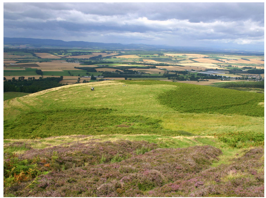
Fig. 5. Enclosure with rig and furrow on Waughenwae Knowe (SF127), looking north across Strathearn

On Waughenwae Knowe is a series of quarries clearly associated with the construction of the straight stone dykes marking 19th-century improvement. These are very similar in size and function to quarries found in previous seasons. On the summit of the knowe is a substantial enclosure with an area of rig and furrow within it (Fig. 5).