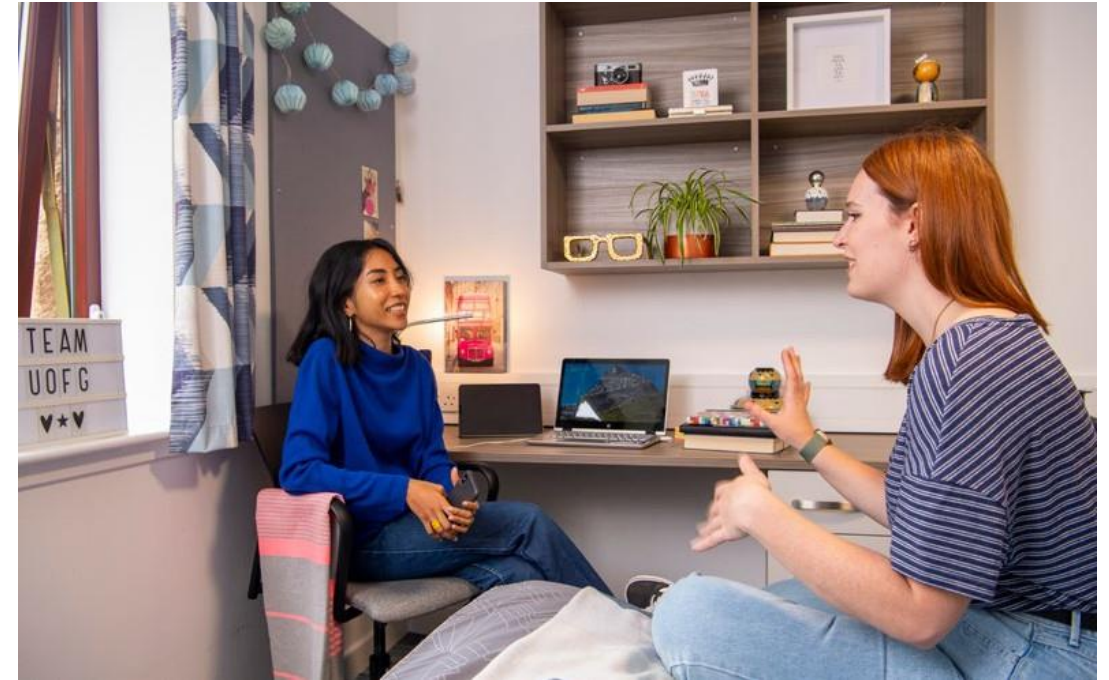
Accommodation Services offer a variety of residences and room types to choose from.