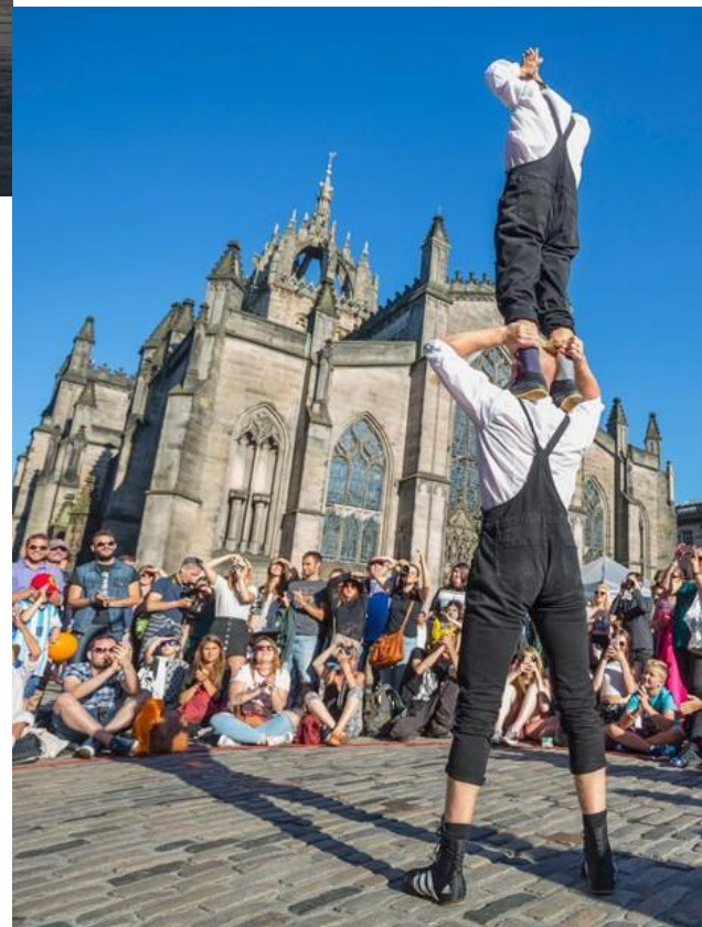
Performers, Edinburgh Fringe Festival.

Scotland has played a starring role on the big and small screen, as the filming location for top films and TV shows including Outlaw King , 1917 , Skyfall , Harry Potter and The Batman . In fact, the University itself is frequently used as a filming location and has featured in several episodes of Outlander . See visitscotland.com