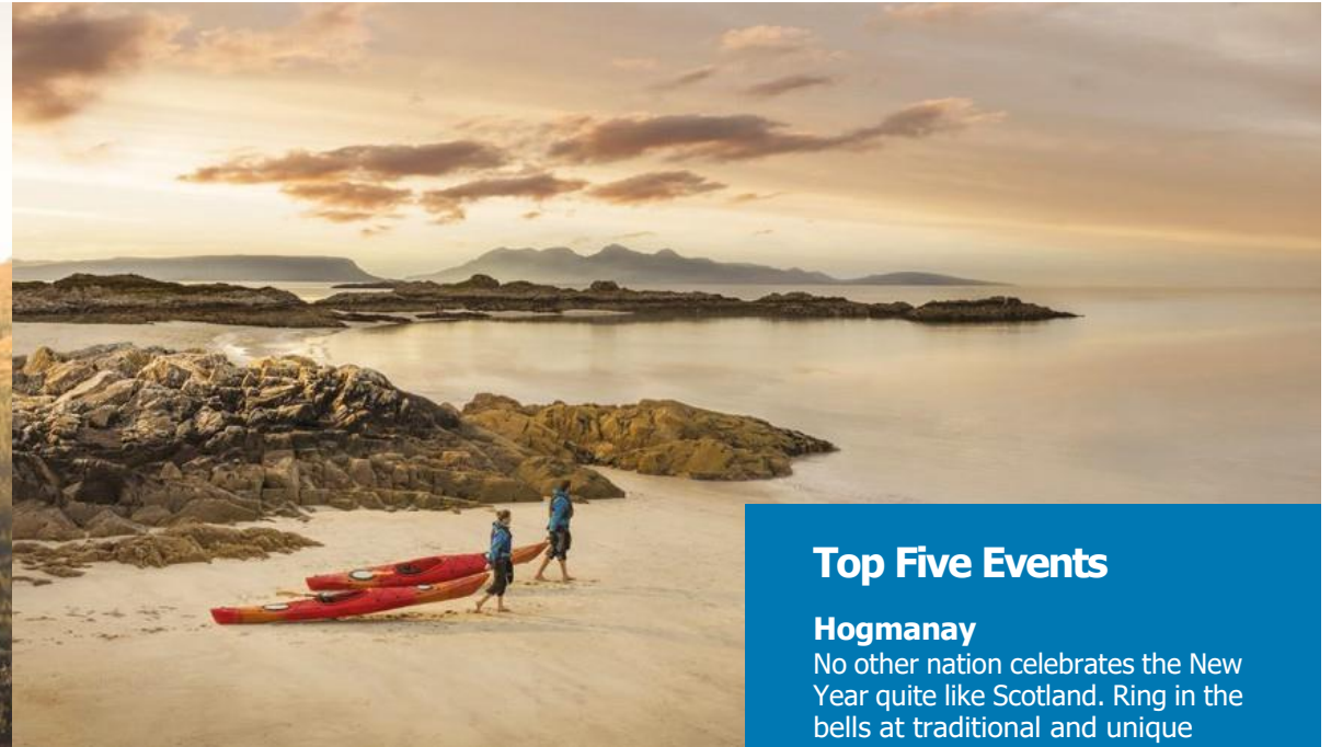
Camusdarach beach, Arisaig, Scottish Highlands.