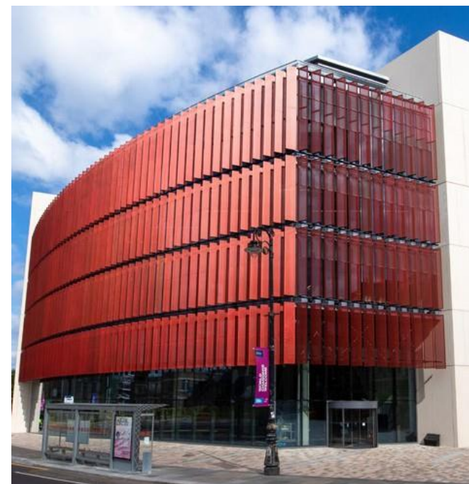
Our James McCune Smith Learning Hub at the heart of the main campus.

You will be taught by dedicated, passionate academics, in flexible and innovative learning environments with access to state-of-the-art buildings, facilities, and resources. You can access guidance and support from your adviser of studies, class and student representatives, and multiple specialist support teams including IT support and an on campus GP.