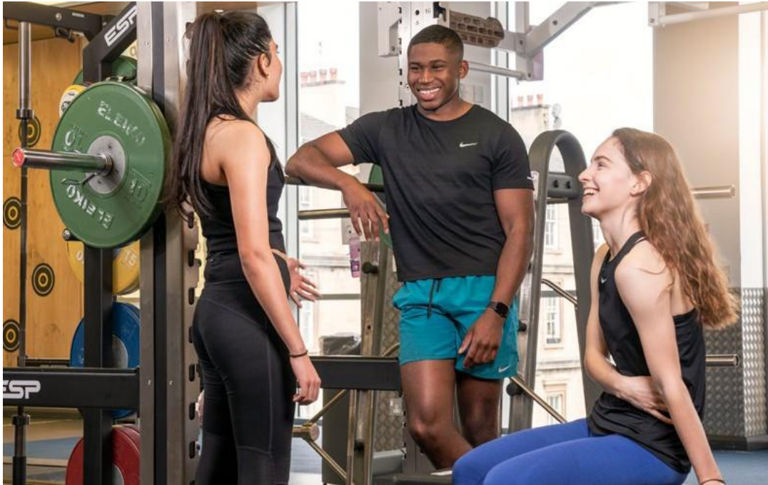
Over 50 sports clubs cater to all skill levels and abilities.