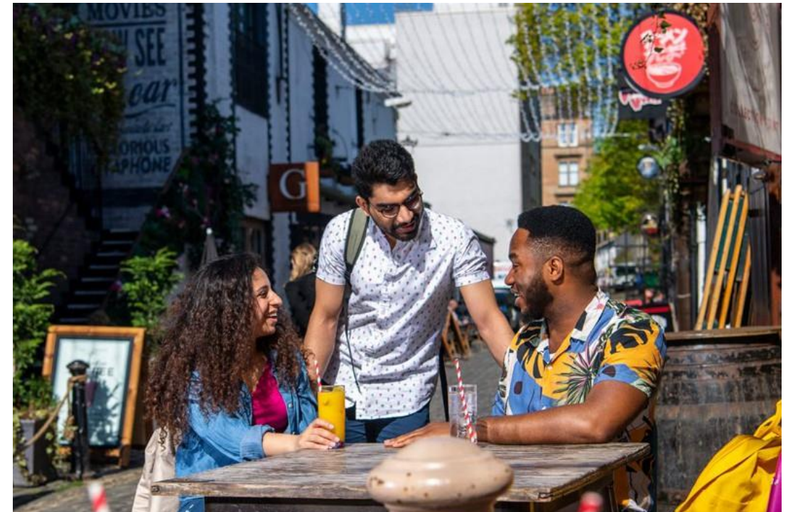
Ashton Lane, a lively cobbled lane next to the University which is packed with bars, restaurants and a cinema.

Glasgow is synonymous with sport. It became the European Capital of Sport in 2023, becoming the first city to take the title twice. In the same year the city also hosted the UCI Cycling World Championships. See visitglasgow.com