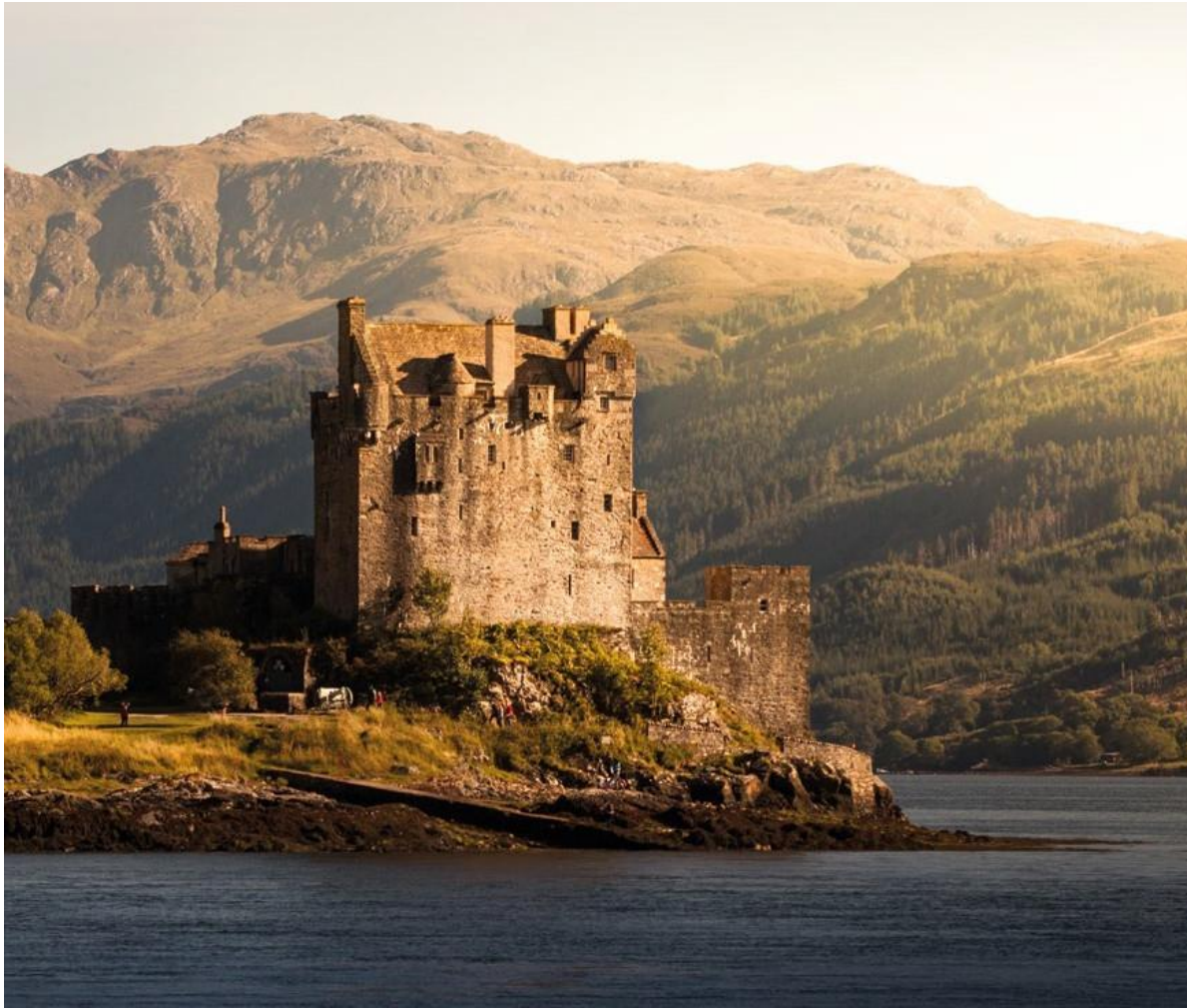
Eilean Donan Castle, Loch Duich.