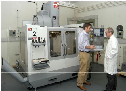
HAAS 5-axis mill