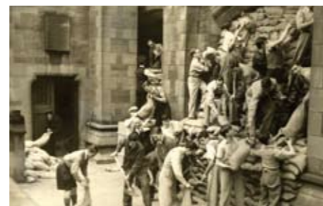
Air Raid Precautions at the University during the Second World War, 1939