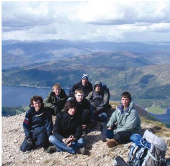
Sgorr Dhearg, Beinn a'Bheithir