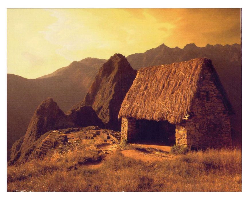
fig.2: The Watchman's Hut at Dawn (Neruda and Brukoff, front cover and p. 126)

Similarly, some of the photos placed before the poem could be interpreted as symbolising the ascent to the city that the reader is about to undertake, as for example the images on the inner front and back cover, depicting a close-up of steps occupying two pages; or the photograph accompanying the table of contents, taken from a very low angle and showing the hill where the watchman's hut is, which can just be discerned at the top (see figure 3). Moreover, an interesting technique used by Brukoff is positioning the viewer in front of a doorway or window, which gives the image a realistic 3D effect. This may also function as an enticement to go further and may bring the reader closer to experiencing the journey (see figure 4).