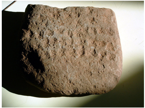
Figure 6. Senet board from Nikitari Petrera