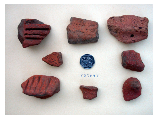
Figure 5. Sample of pottery from Nikitari Petrera