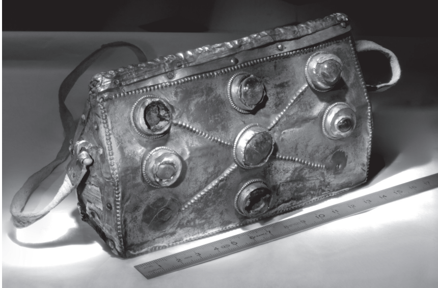
Figure 5. Portable reliquary with carrying strap. Late 8th century. Gilded copper panels with cabochons of coloured glass and possibly amber on wood core; 15.1 × 5.2 × 9.2 cm; with leather strap. Musées de Sens, Trésor de la cathédrale Saint-Etienne F.63.70.

carrying strap intact at Sens (Fig. 5) may give an idea of what the unfortunate Inchmarnock priest was carrying. Perhaps an event that started as a liturgical procession ended in a hostage-taking when raiders suddenly attacked: a reliquary was equally portable in both contexts.