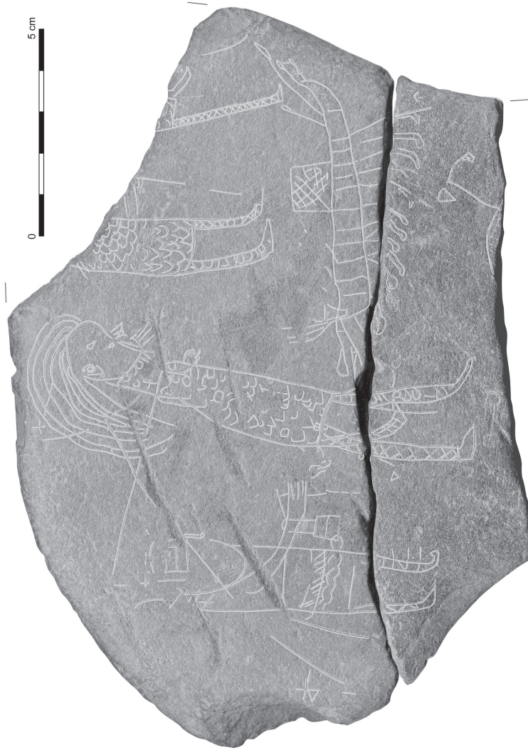
Figure 4. Inchmarnock 'hostage' stone. St Marnock's church, Inchmarnock (Argyll and Bute). Flat beach pebble, recovered in two parts, 180 \times 120 \times 12 mm in its extant, incomplete state. Reverse has short sequence of letters and cruciform design; c.800–c.1300. © Headland Archaeology (UK) Ltd. Reproduced by permission from Christopher Lowe (ed.), Inchmarnock: An Early Historic Island Monastery and its Archaeological landscape (Edinburgh, 2008).