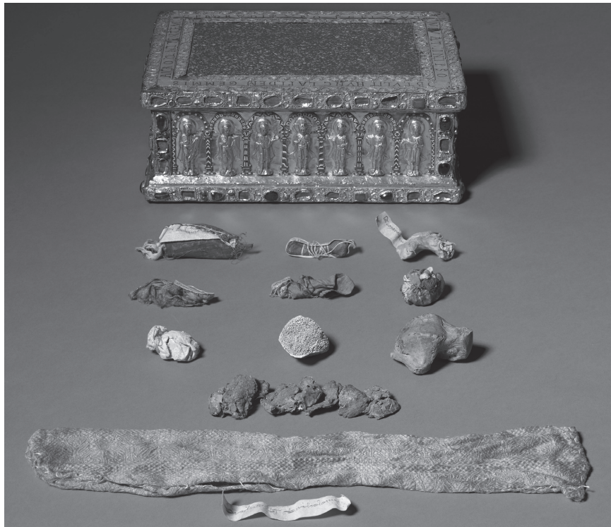
Figure 1. Portable Altar of Countess Gertrude. Germany, Lower Saxony(?), Romanesque period, shortly after 1038. Gold, cloisonné enamel, porphyry, gems, pearls, niello, wood core; 10.5 × 27.5 × 21.0 cm. Gift of the John Huntington Art and Polytechnic Trust 1931.462.

acquired in 966 and which remains in Utrecht. 12 Others consisted of fragments of bone, chips of stone, handfuls of dust and the like. These were commonly wrapped in scraps of linen or brightly patterned silks, probably cut from discarded church hangings or liturgical vestments, and tied firm. Sometimes, the fabric was stitched into small pouches, which helped keep friable matter together. From the seventh century, if not earlier, labels on scraps of parchment (and, in the very early Middle Ages, papyrus) identified the contents of each package, but might be replaced when they tore, became detached or were no longer legible. The surviving contents of the portable altar commissioned by Gertrude, Countess of Brunswick (d. 1117) are characteristic (Fig. 1): there are several tiny bundles wrapped in