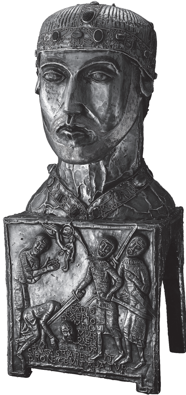
Figure 6. Reliquary-head of St Candidus. Saint-Maurice d'Agaune, third quarter of the twelfth century, 575 × 247 mm. Silver repoussé with gold filigree and cabochons, on wood core. © Abbaye de Saint-Maurice. With permission.