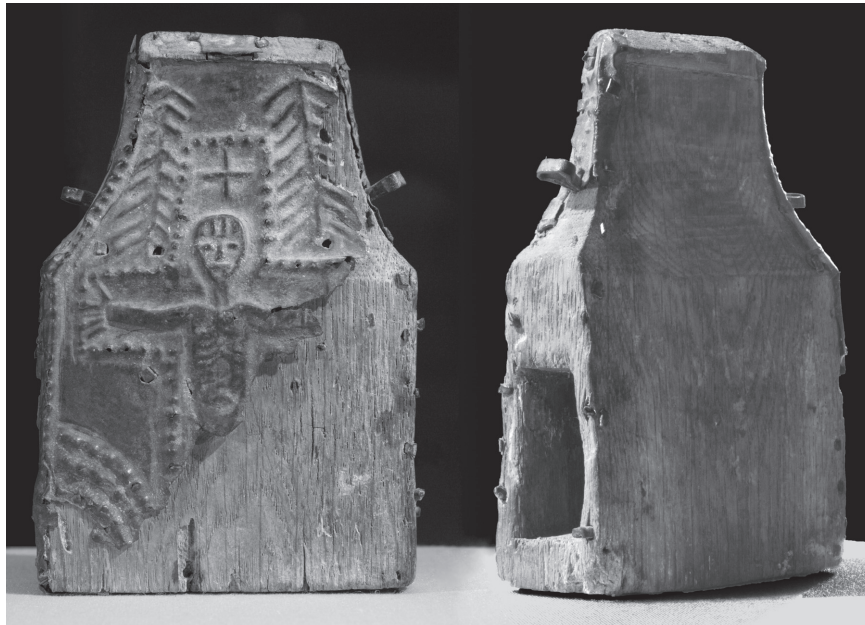
Figure 3. Purse reliquary. Provenance province of Namur, probably Beauraing, 7th/8th-century. Copper-alloy repoussé panels on oak core; 12.5 × 7.5 × 2.5 cm. Musée du Cinquantenaire, Musées royaux d'Art et d'Histoire, Bruxelles B005717–001.

reliquary to be suspended from a beam, slung around the neck, or carried in procession (Fig. 3). 34 The only way to access the relics inside reliquaries of this type is to dismantle them: excavations at Winchester in 1976 uncovered an example which has never been disassembled and whose contents are only visible via X-ray and cannot therefore be identified. 35 Similarly, all trace of relics sealed into altars was likely to be lost unless they had been itemised in an external inscription or a documentary inventory at the time the altar was consecrated. 36 By the same token, even when the box in which relics were placed inside the altar cavity included details of its contents, that information was inside, invisible to human eyes—until revealed