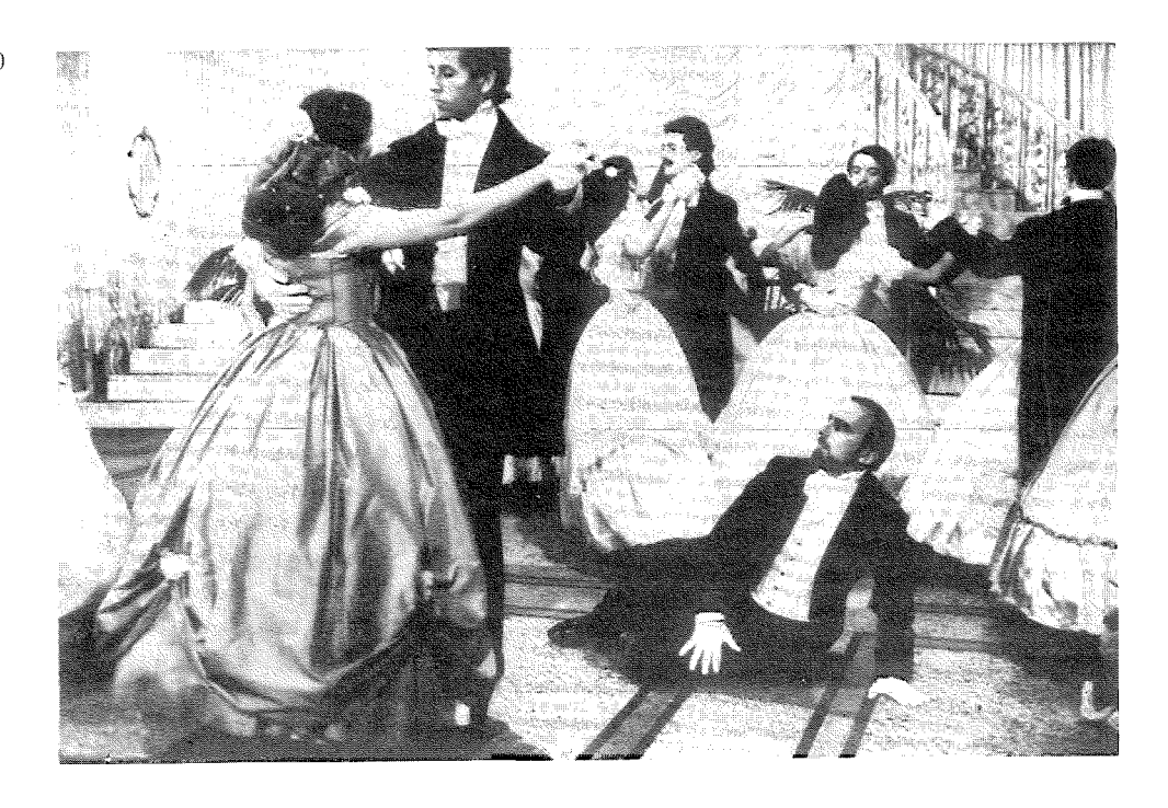
Above, the waltz scene in The Gold Diggers .

abstraction of the action into physical geometry that Busby Berkeley uses, and presumably for good political reasons. There's very little ensemble dancing, for instance, except in the waltz scene.