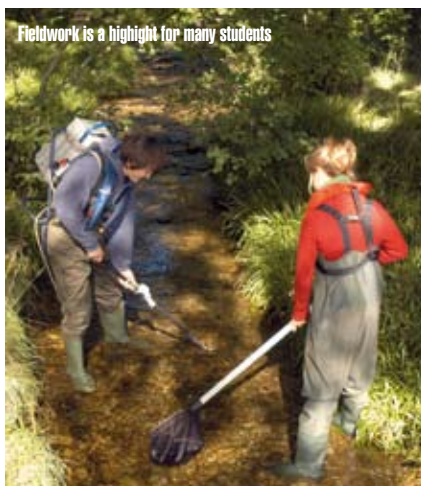
Fieldwork is a highlight for many students

If you would like to support the SCENE campaign, please complete the Giving Form on pages 7-8.