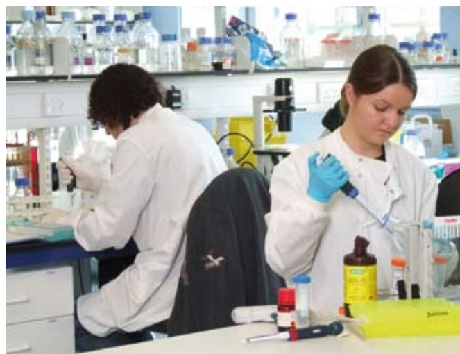
The three bequests will be directed towards medical research in the University.

Both of these bequests will be directed towards medical research, and the Medical Fund