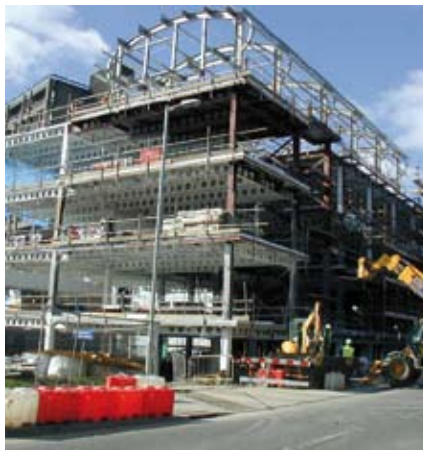
Building work well underway on the new research centre earlier this year.