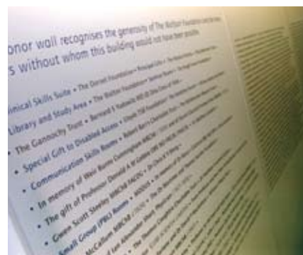
Above: The Donor Wall in the Wolfson Medical School Building. A new online donor wall will be launched by the University this year.

this fund has never had a physical presence on campus in the same way as the other campaigns. This will be rolled out to all donors to the University in due course and we will be in touch with our supporters soon.