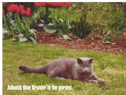
Admish Blue Bruiser in the garden.

The Gifted Scheme (see table below) allows you to support the Small Animal Hospital campaign and name your gift in perpetuity.