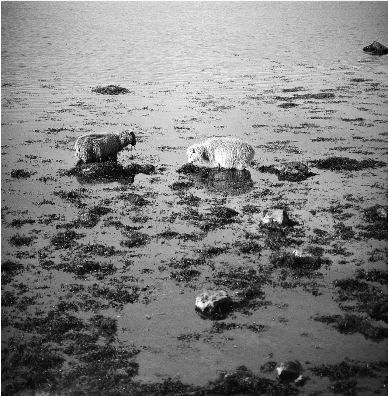
Hill sheep. Diet of heather and seaweed.