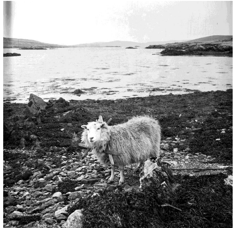
Shetland Sheep with hamesticks or branx