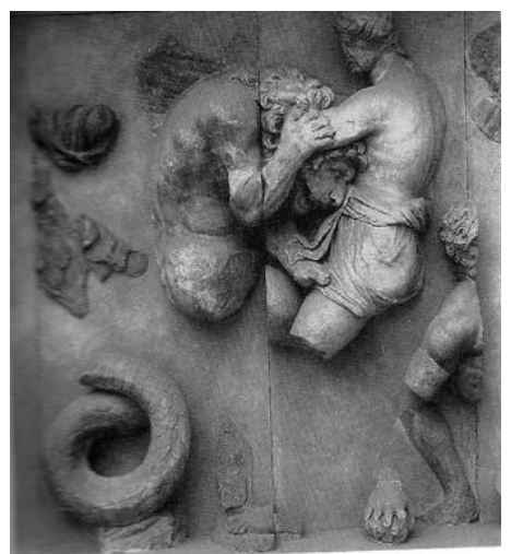
Fig. 4. Hellenistic marble relief frieze detail from the Great Altar of Zeus at Pergamon, 2<sup>nd</sup> century B.C., Berlin, Pergamonmuseum (Woodford, Susan. 2003. Images of Myths in Classical Antiquity . Cambridge: Cambridge University Press. Figure 94. 125)

This moral change in their bodies is epitomized in one particularly unusual image of a hybrid giant [Fig. 4], whose lion head and serpent tails for legs take the animalising and moralising themes found in Greek art even further.