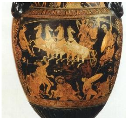
Fig. 3. Apulian red-figure krater, c.350 B.C., Lycurgus Painter. Saint Petersburg, Hermitage Museum B1714.

The impious aspect of the barbaric Gigantes is also expressed in art after the mid-fifth century B.C. through the positioning of giants and gods. It is after this point that the gods are placed higher than the Gigantes on vases, rather than being level with them. Placing gods above and giants below visually reflects the place of each in the Greek view of morality.