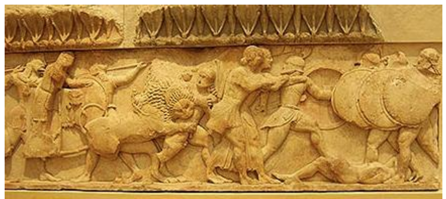
Fig. 1. Detail of North frieze of the Siphnian Treasury, c.530-525 B.C., Delphi, Delphi Museum http://www.virtourist.com/europe/greece/delphi/imatges/17.jpg

frieze of the Siphnian treasury at Delphi [Fig. 1]. Early depictions of the battle between Gigantes and gods focused on the martial element (Woodford 2003, p.122), presenting the giants as warriors with conventional armour and weaponry. On the treasury frieze, Apollo and Artemis attack the Gigantes, who are formed into a phalanx, a battle-line of hoplites with overlapping shields. While the phalanx suggests united strength, this image is juxtaposed with a dead giant lying stripped on the ground. The lion drawing the chariot of Themis, the goddess of law and order, also shows the ultimate vulnerability of the Gigantes to the superior force of the gods by bringing down one of the giants.