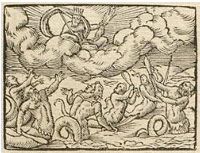
Fig. 5. Aneau, Picta Poesis (1552, p.57) www.emblems.arts.gla.ac.uk/french/emblem.php?id=FANa048

In addition to the broad context of rebellion against the social order, the Gigantomachy is treated in moral terms because of the body forms and behaviour of the giants. In Aneau's 1552 Picta Poesis , an emblem with the motto 'Great Ignorance' was accompanied by a depiction of snake-legged Gigantes [Fig. 5].