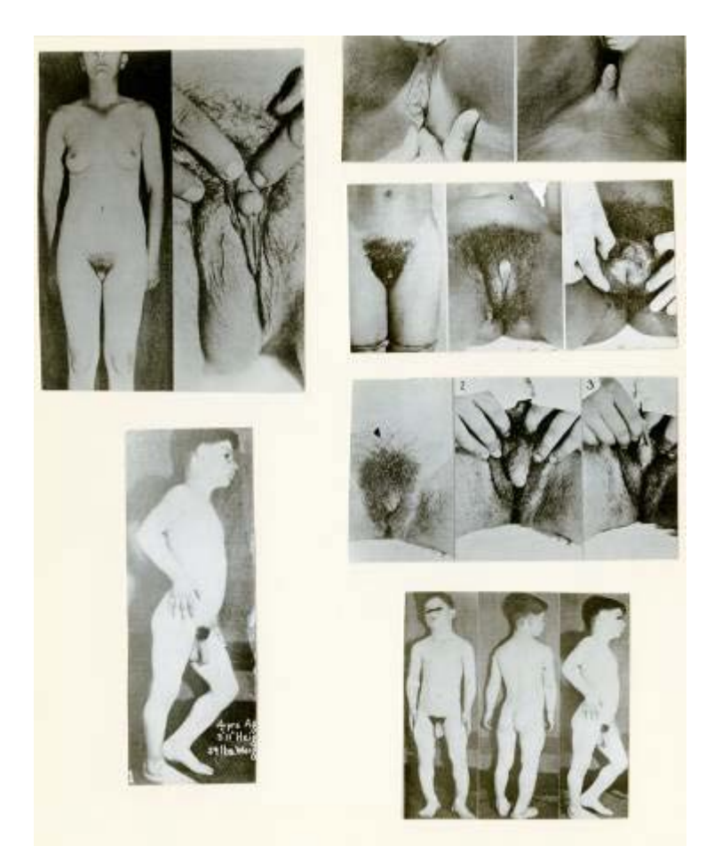
Figure 2: Image set from the Kinsey Institute for Research in Sex, Gender, and Reproduction's file on Intersex Conditions