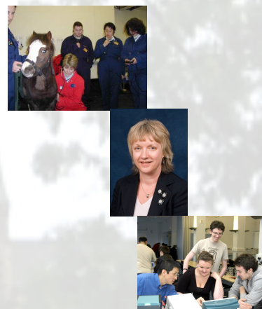
Figure 2: The Academic Development Fellows

Surveys from the present NLTP participants have revealed that they find the discipline-specific part of the NLTP more relevant to their teaching. However, they also state that they continue to enjoy meeting with their cross-discipline peer groups. Preliminary results of the ADFs' research have revealed that a lot of teaching is similar across disciplines, as supported by Young (2010). It has also identified that there are types of teaching specific to disciplines, such as laboratories, practicals, observation and topics supported by governing bodies that are specific to certain disciplines such as professionalism in the clinical subjects. The ADFs are conducting research into this area.