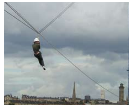
150ft over Glasgow on the Charity Zip Slide