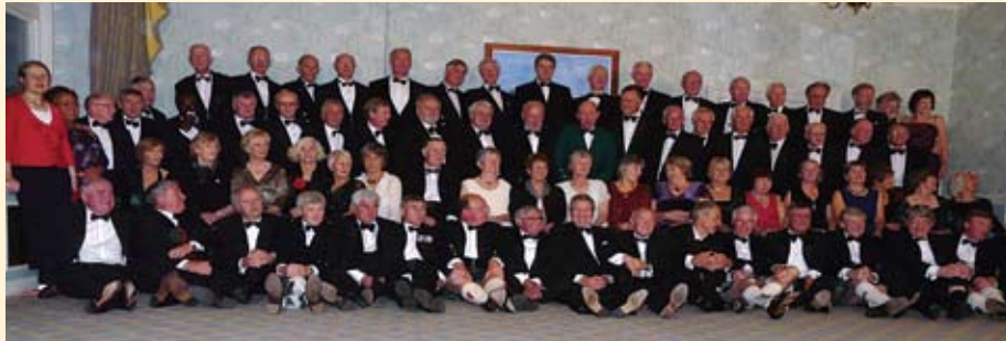
Alumni from the 1968 Beta Club raised £5,000 for medical education at the University.