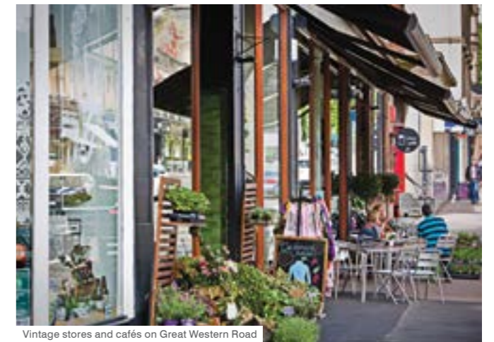
Vintage stores and cafés on Great Western Road