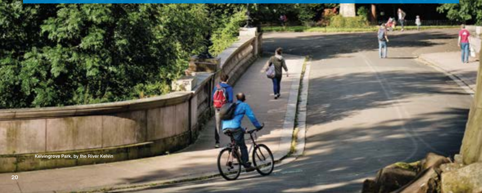
Kelvingrove Park, by the River Kelvin

The West End is also home to one of the most visited museums in the United Kingdom outside of London, the Kelvingrove Art Gallery and Museum. The museum has 22 themed galleries displaying over 8,000 objects, plus entry is completely free.