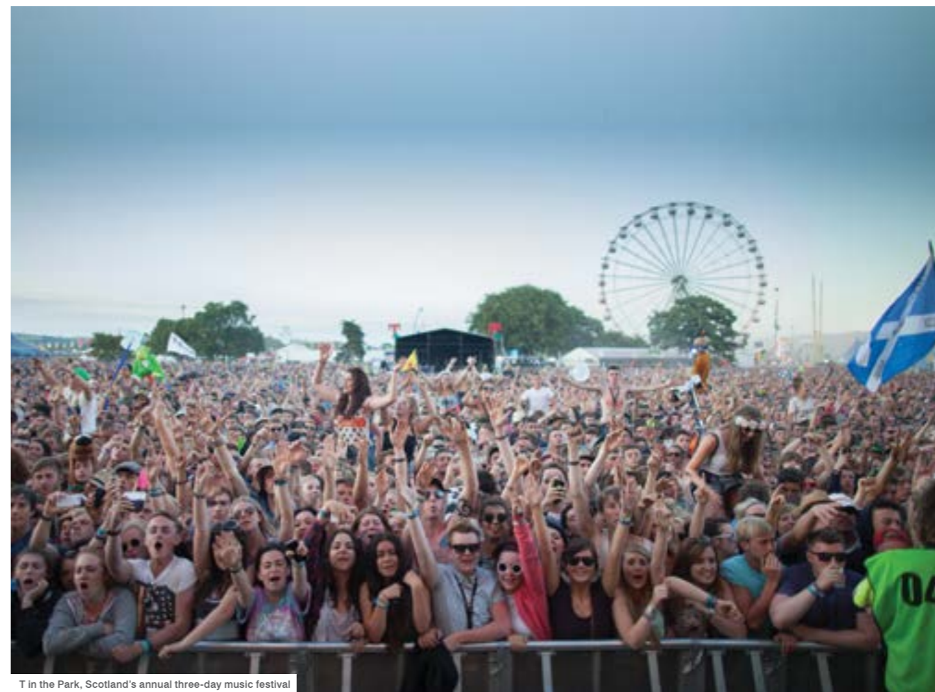
T in the Park, Scotland's annual three-day music festival