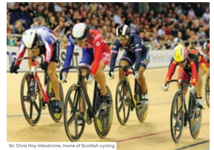
Sir Chris Hoy Velodrome, home of Scottish cycling