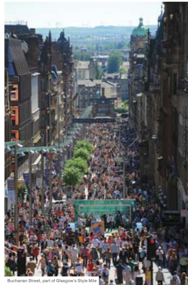
Buchanan Street, part of Glasgow's Style Mile