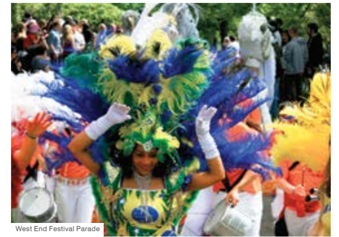
West End Festival Parade