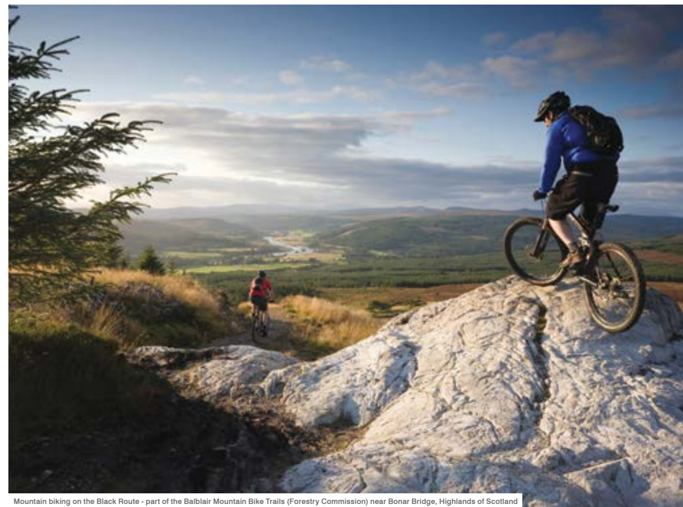
Mountain biking on the Black Route - part of the Balblair Mountain Bike Trails (Forestry Commission) near Bonar Bridge, Highlands of Scotland

For more information on Scotland, check out www.visitscotland.com