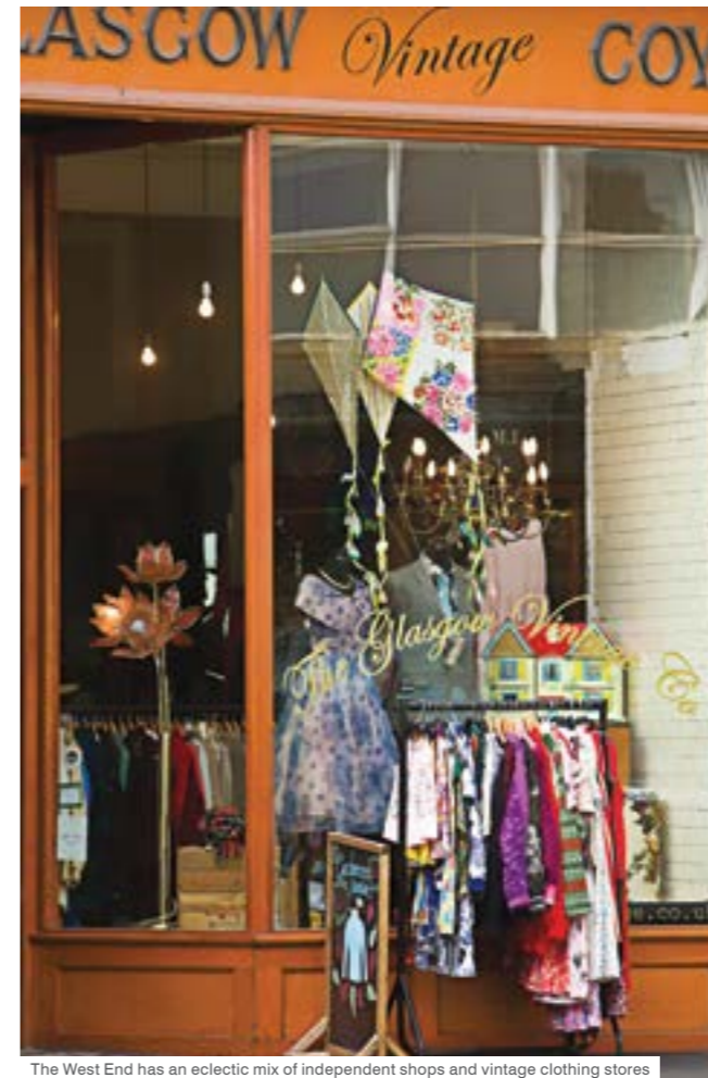
The West End has an eclectic mix of independent shops and vintage clothing stores