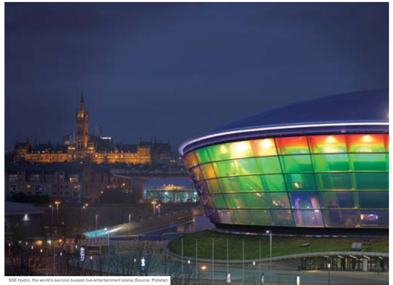
SSE Hydro, the world's second-busiest live entertainment arena (Source: Pollstar)