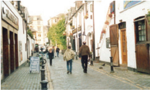
Ashton Lane, Glasgow