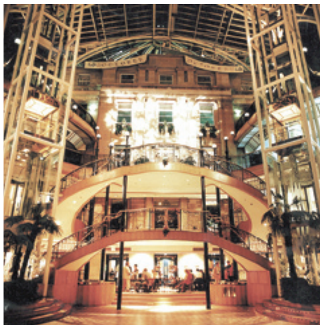
Princes Square, Glasgow

Mix of plenary and parallel workshop sessions