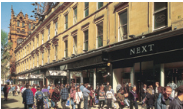
Buchanan Street, Glasgow