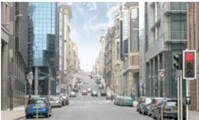
West Campbell Street, Glasgow