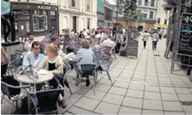
Merchant City, Glasgow