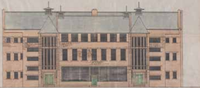
ELEVATION TO SCOTLAND ST.